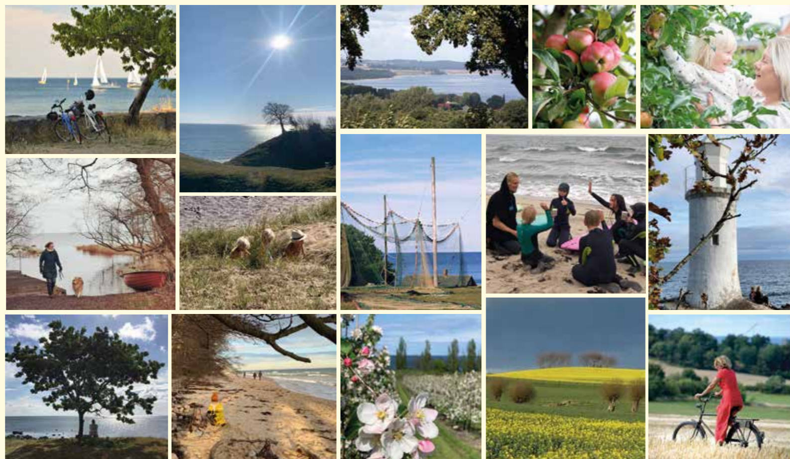
Several of these pictures come from Kiviks Turism's photo competition on Instagram. All pictures are taken in the beautiful local surroundings at Kivik.