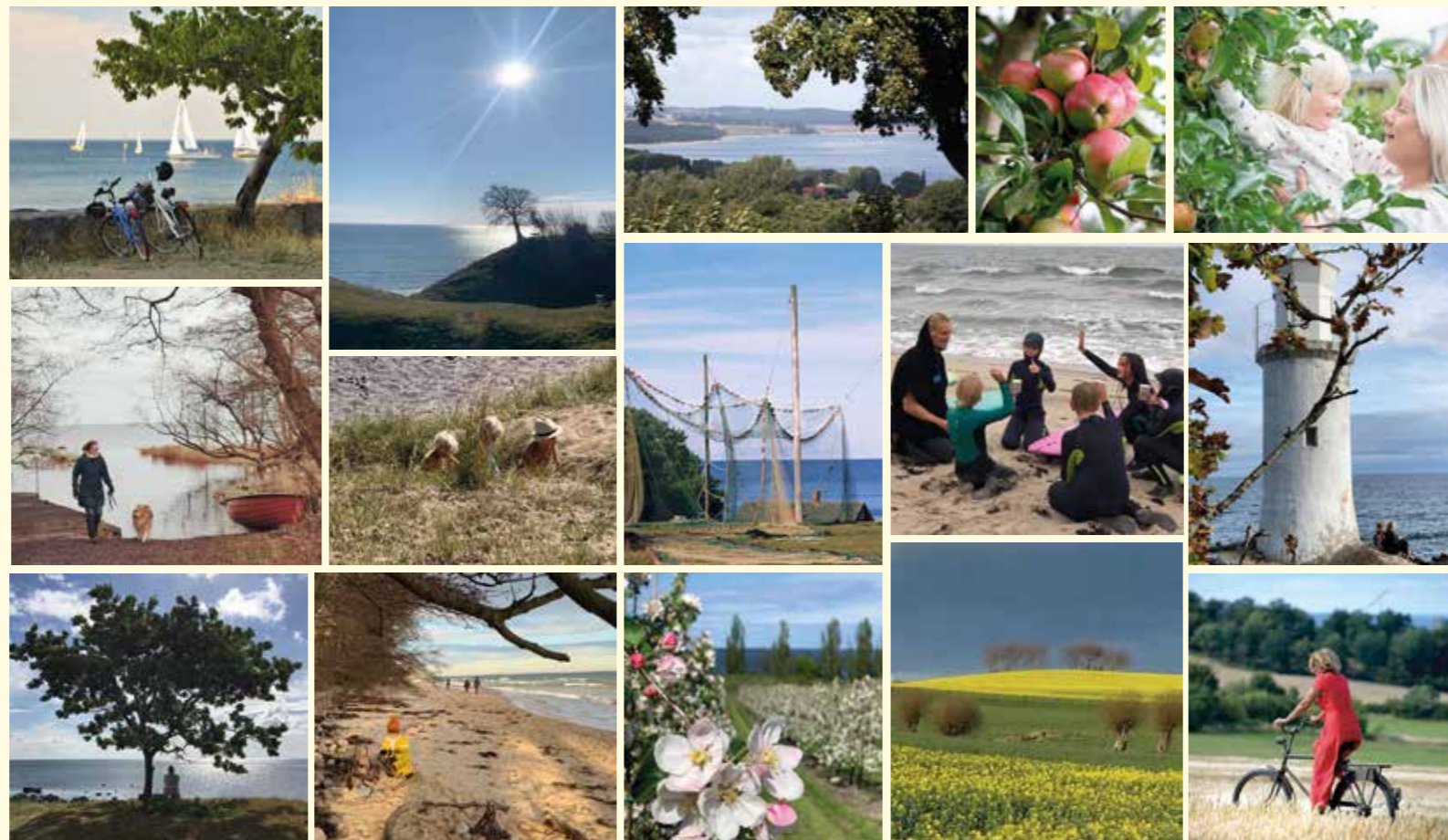
Several of these pictures come from Kiviks Turism's photo competition on Instagram. All pictures are taken in the beautiful local surroundings at Kivik.

During all of 2021 we urge you to please check the webpage of every event for Covid-19 updates. Thank you!